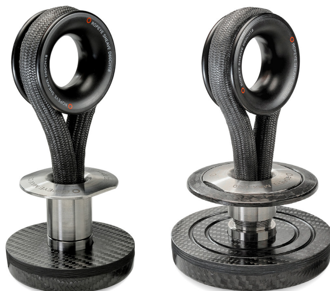
Ropeye MAXI 80

Ropeye MAXI comes in two versions: MAXI 80 and MAXI 100. Metal parts available in Corrax and Titanium.