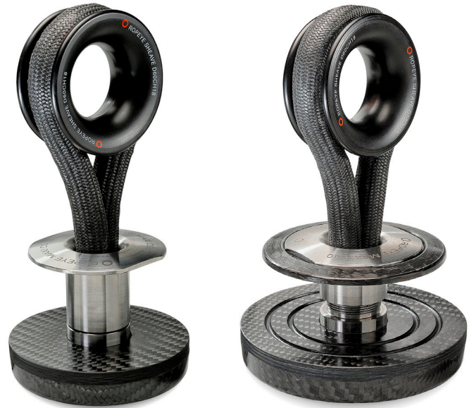
Ropeye MAXI 80

Ropeye MAXI comes in two versions: MAXI 80 and MAXI 100. Metal parts available in Corrax and Titanium.